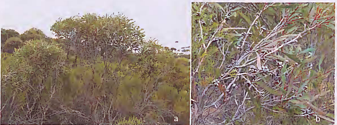
Figure 4: Eucalyptus wimmerensis subsp. parviformis . a. mallee form, Nurcough F.R.; b. fruits, Nurcough F.R.

Additional specimens examined: VICTORIA: Jane Duff Reserve 36° 43' 50" S., 141° 43' 18" E. K. Rule 2112 and L. Rule, 24 iii 2012 (MEL); Nurcough F.R., north-south boundary track, c. 200 m S from east-west access track 36° 40' 45" S., 141° 43' 22" E. K. Rule 2512 and L. Rule, 24 iii 2012 (MEL); Mitre-Nurcough Road, c. 700 m from Fullers Road towards Mitre, 36° 41' 20" S. 141° 44' 30" E. K. Rule 2612 and L. Rule, 24 iii 2012 (MEL); Start of access track to Nurcough F.R., 36° 40' 50" S., 141° 44' 15" K. Rule 11112 and L. Rule, 18 xi 2012 (MEL); Golf Course Road, on boundary of the Mt Arapiles section of the Mt Arapiles-Toooan S.P., 36° 46' 25" S., 141° 48' 30" E., K. Rule 4913 and J. Dowling, 13 xi 2013 (MEL); Adjacent to Nurcough F.R. on private land, 36° 41' 00" S., 141° 43' 40" E., K. Rule 99103, 11 xi 1999 (MEL); Access track on northern side of Mt Arapiles, 36° 44' 30" S. 141° 50' 00" E., K. Rule 5305, 24 ix 2005 (MEL).